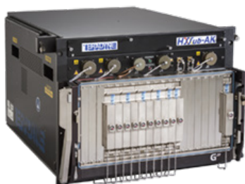
Figure 6: Cable or ITA Interface

The cable approach is appropriate when there is a simple bus relationship from instrument to UUT connectors. An ITA is appropriate for cases where buses in multiple instruments buses are distributed to multiple UUT connectors in a more complex manner.