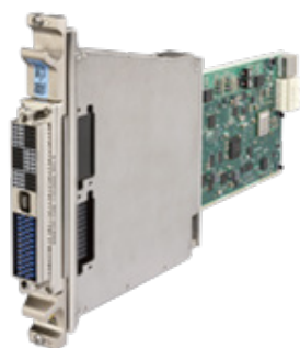
Figure 5: Funnel Instrument Interface

Many systems do not have an existing, technically acceptable interface approach, and the HSSub Mass Interconnect approach is a common solution. The combination of HSSub instruments and unique funnel modules support both Virginia Panel G20 ITAs and i2 MX cabled connections.