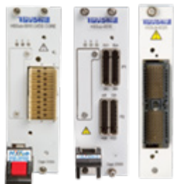
Figure 4: Front Panel Instrument Interface

HSSub physical interface options support a broad range of mechanical system configurations. Systems that already have a suitable UUT interface approach can use Direct-to-Instrument interfacing.