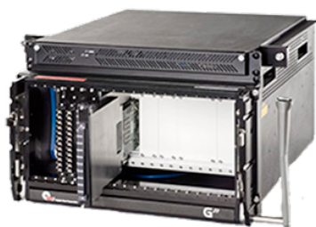
Figure 3: HSSub Foundation

HSSub Foundations provide a PXI Express 3U chassis, a 64-bit Windows-based computer, and the TriFlex™ infrastructure software. A family of available Foundations support internal and ancillary system integration, or standalone table-top use. Foundation capacities range from 3 to 17 instrument slots, and multiple chassis can be combined for additional capability.